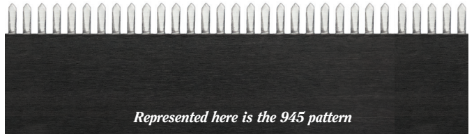
Represented here is the 945 pattern

The 5 patterns of the New PERFormaX family: